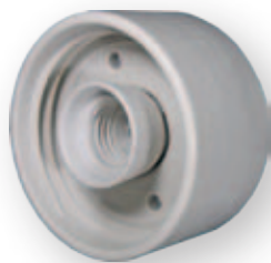
Porcelain lamp holder E 27-203